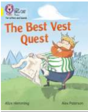
Book title- The best Vest Quest